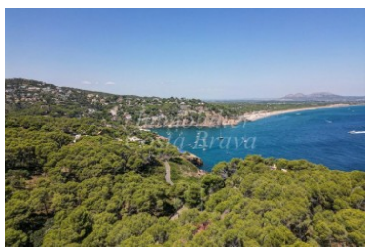
See more information about this property on our website